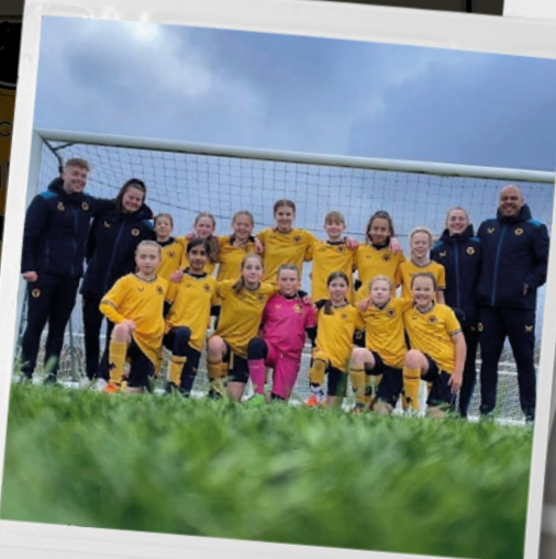
Congratulations - finalists!