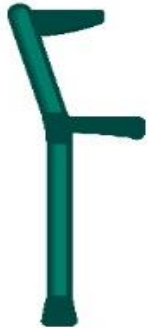
CRUTCHES/ WALKING AIDS